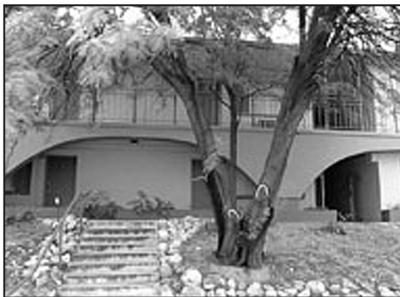
STUDIO (350 Sq. Ft.)