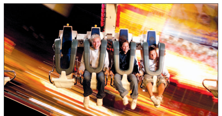
The year in photos PAGES B18-19