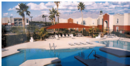
STERLING OFFERS a resort style pool and hot tub