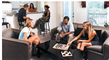
LARGER, SPACIOUS living areas allow students to comfortably entertain friends in a relaxed atmosphere.