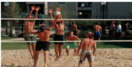
RESIDENTS ENJOY a competitive game of volleyball