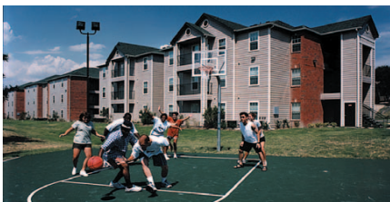
STUDENTS ENJOY a friendly game of basketball.