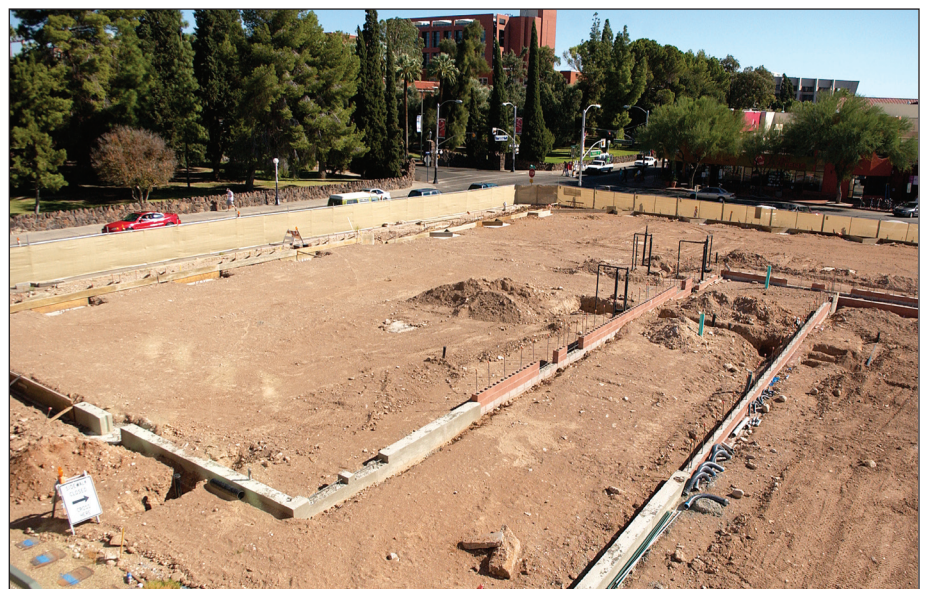
The Marshall Foundation's lot on the corner of University Boulevard and Park Avenue remains vacant. Construction will resume after a delivery of cement arrives next week.

While cement shortages have delayed the Marshall Foundation construction, projects at the UA have been spared significant delays, although there have