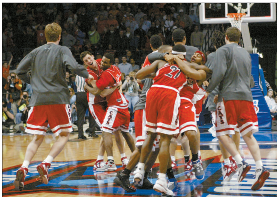
TOP: UA senior guard Salim Stoudamire celebrates after knocking down the game-winning shot last night as the No. 3 seed Wildcats defeated No. 2 seed Oklahoma State, 79-78, in Allstate Arena in Rosemont, Ill. BOTTOM: Stoudamire's teammates celebrate at midcourt after the clock ran out, sending Arizona to an Elite Eight matchup with No. 1 Illinois tomorrow.

Cats set up showdown with top-ranked Illinois